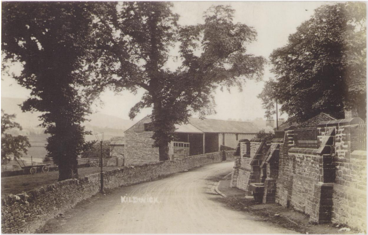
Figure 1: Water trough adjacent to Kildwick school

It took less than 15 minutes for the dye to appear – far faster than would be required for water to percolate through the ground.